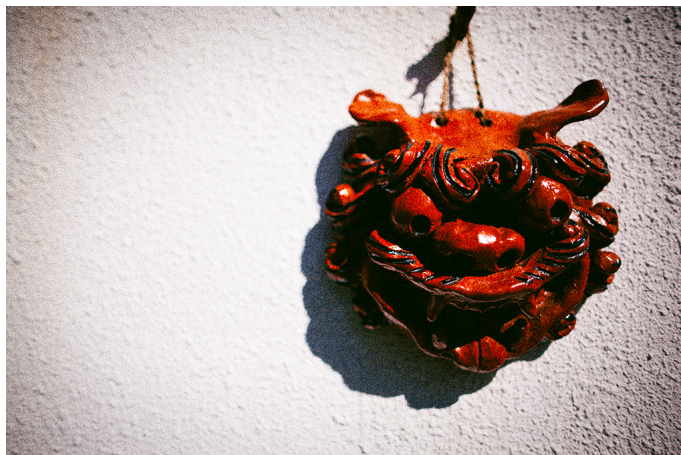
Handcrafted lion-dog face in Yomitan Village, Okinawa Japan.